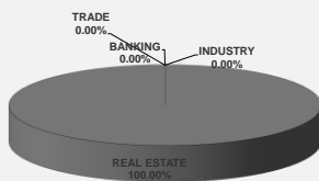
BEIRUT STOCK EXCHANGE DAILY TRADING VOLUME