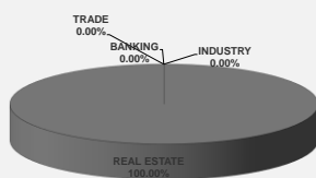
BEIRUT STOCK EXCHANGE DAILY TRADING VOLUME