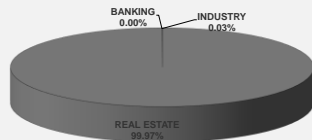
BEIRUT STOCK EXCHANGE DAILY TRADING VOLUME