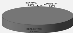
BEIRUT STOCK EXCHANGE DAILY TRADING VOLUME